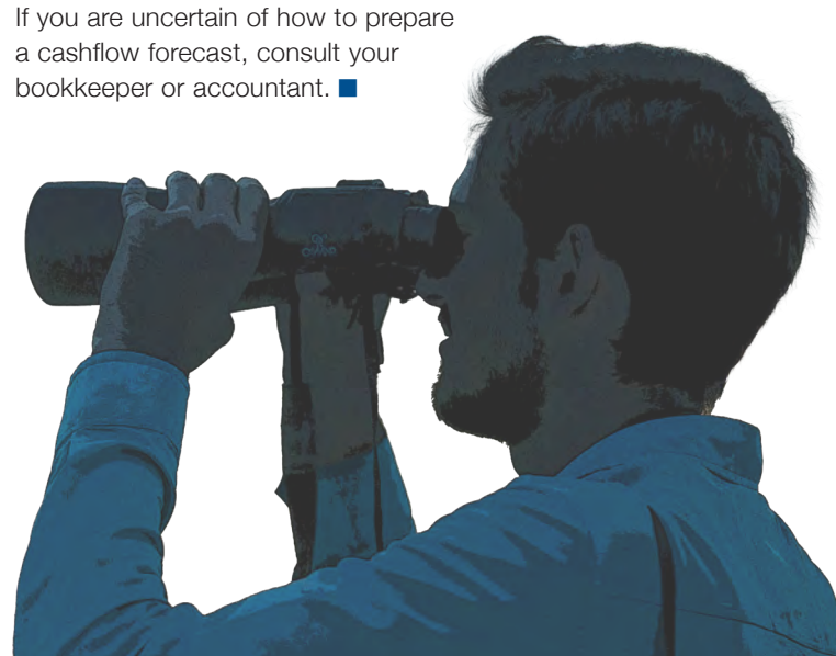
March 2022 | www.umbrellaaccountants.com.au | 7